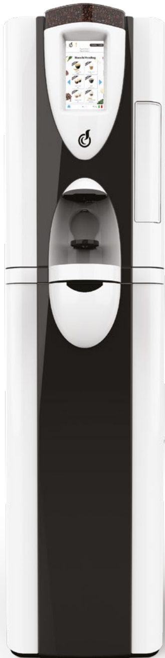
LEI SA RY TOUCH 7" + CABINET