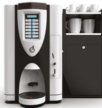
LEI SA RY EASY + FRESH MILK MODULE (optional accessory)

LEI SA RY, a semi-automatic OCS (Office Coffee Service) machine offering coffee in all its various flavours.