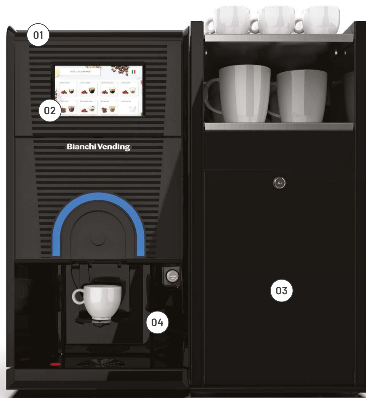
GAIA STYLE RY TOUCH 7" + FRESH MILK MODULE (optional)

Gaia Style Ry renews the pleasure of good company at the office, store or studio: a design element that makes the setting more pleasant, a menu with many possible options providing all the freedom of choice that you could ever want.