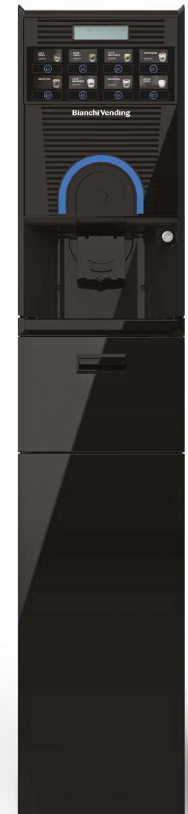
GAIA STYLE EASY + CABINET

♡ A safe break is a break that keeps people smiling: because peace of mind is essential for total enjoyment.